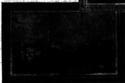
"Canal at Venice" by Conoletto, 32" x 46" overall

Enjoy the rich heritage of the world's great art. These are reproductions of paintings by the greatest names in art, both past and present. They are so perfectly reproduced that you might think you were looking at the costly originals! And the magnificent gallery-type frames are in keeping with the fine quality of these reproductions. Adding beauty and distinction to your home, their impressive size makes them ideally suited for display over your fireplace or on your living room wall. Each picture bears a label on back, giving a story about the artist who painted the original. This outstanding collection is on display at both stores.