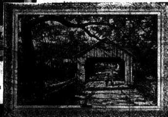
"Vermont Bridge" by Eric Stone, 29" x 40" overall