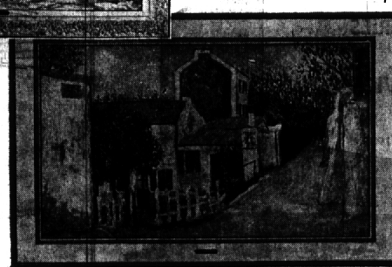
"Rue St. Vinič" by Maurice Utrillo, 29" x 45" overall