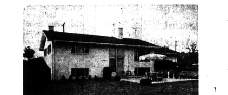
ON THE GOLF COURSE! Exquisite interior—call us to see it. Three bedrooms and two bathrooms. Fireplace in living room as well as in family room. New carpeting. GREAT PATIO for outdoor living. $32,900.00.