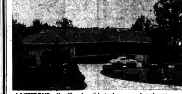
LAKEFRONT —You'll enjoy this truly unusual and custom planned Tri-level overlooking scenic Chalmers Lake. With a flexible floor plan, you may use 2 or 3 bedrooms, separated "quiet-hour" library, 15 x 30 recreation room, 2 fireplaces, and att. 2 car garage. NO EXPENSE SPARED! $56,500.