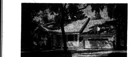
BLAME NO ONE —but yourself, if you miss seeing this four bedroom 2½ bath home near schools, churches and Chesterfield shops. Bedrooms are extra large, one is paneled and could be a lovely library. 32' living room with beamed ceiling. Great recreation room with fireplace. Built-in oven and range. IT'S REALLY GREAT! $31,500.00.