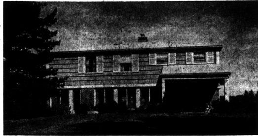
LOOKING FOR A HOME ON THE LAKE? WE HAVE IT! Spectacular view of Lower Long Lake from living room, dining room and family room. Five bedrooms, three baths and a library. Family room is air-conditioned and the wonderful kitchen has a fireplace. Builder's own home—full of deluxe features. Great value. Sailboat and raft included. HOW ABOUT THAT! $58,600.00.