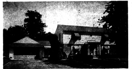
IF WHERE YOU LIVE IS IMPORTANT TO YOU — See this superb home. Three twin sized bedrooms with dressing room off master bedroom and 2½ baths. Separate dining room, paneled library and Florida room. Many large closets. Sprinkling system front and rear. Excellent condition—A PLEASURE TO SHOW.