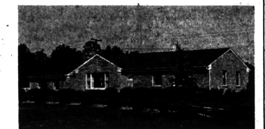
ROMPING ROOM —On an acre site studded with fruit trees, a growing and active family will have loads of play room outside. Inside, there are 3 nice bedrooms, separate dining room, library, full basement with finished recreation room, and att. 2 car garage. SEE IT NOW! $32,500.