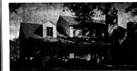
SEE THE GLINT IN HER EYE —when she sees the magnificent 30' family room with cherry paneling and built-ins. Four twin sized bedrooms and 2½ baths. Separate dining room and recreation room. Carpeting throughout, including all bedrooms. Fenced yard for a poach or little children. One block to QUARTON school. Many extra features we'd like to show you. YOU'LL BE PLEASED.