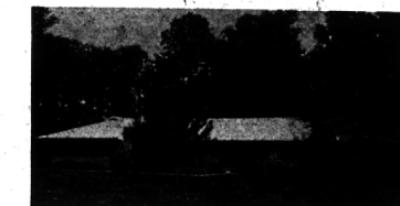
TOWN AND COUNTRY —In a close-in location near St. Regis Church and School, this superbly crafted brick ranch enjoys a truly distinctive setting. Three twin bedrooms, 2½ convenient baths, light oak paneled family room with a "cozy-evening" hearth, large hobby room, and att. 2 car garage. FINE! $45,500.