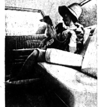
Notice the greater passenger room.

When you inspect the new Continental you will discover why more than half the people who buy in our price range choose the Continental.