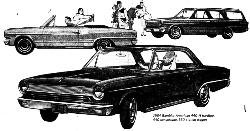
1964 Rambler American 440-H hardtop, 440 convertible, 330 station wagon