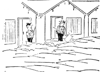
"I'll flip you, Mason—double or nothing!"

Make a list of those "don't needs" today. Dial MI 4-1100 and a Classi Lassi will help you.