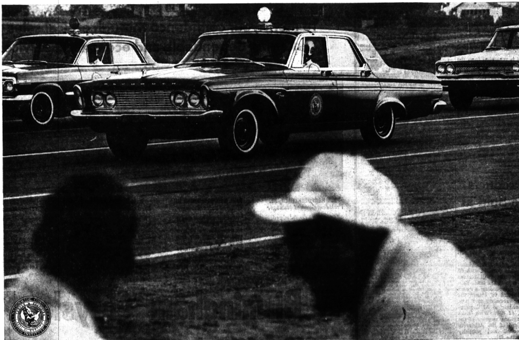
*Your Authorized Plymouth-Valiant Dealer's Warranty against defects in material and workmanship on 1963 cars has been expanded to include parts replacement or repair, without charge for required parts or labor, for 5 years or 50,000 miles, whichever comes first, on the engine block, head and internal parts; transmission case and internal parts (excluding manual clutch); torque converter, drive shaft, universal joints (excluding dust covers), rear axle and differential, and rear wheel bearings, provided the vehicle has been serviced at reasonable intervals according to the Plymouth-Valiant Certified Car Care schedule.

PLYMOUTH DIVISION CHRYSLER MOTORS CORPORATION