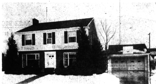
West Beverly Hills $32,900