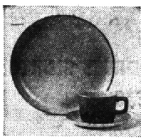
CALIFORNIA TEMPO Fashionable Walnut Background. Choice of beige, blue, Terra-Cotta.