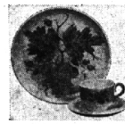
WOODLAND GOLD Rich shades of cream, gold and burnt sienna artistically crafted in universal shapes.