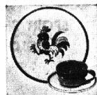
RED ROOSTER Provincial flavor with a distinct "live-cool" red, an achievement in ceramics.