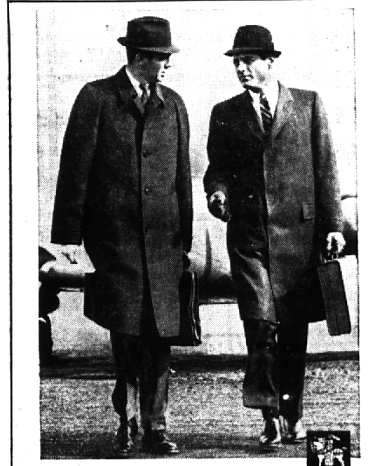
HART SCHAFFNER & MARX

Please send me a list of the ways you need Volunteer help so I may select the way I can best assist. Oakland County Chapter Headquarters, 611 S. Washington, Royal Oak, Phone 546-1012