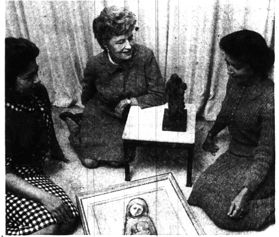
BUILDING A SCHOOL: Fashions and Fine Arts will highlight the tea being given Oct. 3 at the Convent of the Sacred Heart. Proceeds pegged for a new gym which is about to be built. The art exhibit will open at noon and include paintings, sculpture, bronzes and woodcarvings loaned by various