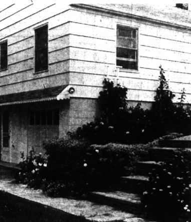
Mrs. Freese playing guitar on lawn.

Cricket's chirp is a sound of the Orthoptera. They resemble grasshoppers in having large hind legs and in their ability to leap. Their wings are flat on the top and bend sharply down the side like a lox cover. Birds and mammals make sounds by vibrating cords in their throats. Insects cannot truly sing for they have no such equipment but produce their sounds by mechanical means. Frequently these are made when the wings are set in motion. Cricket's chirp is a sound of the Orthoptera. They resemble grasshoppers in having large hind legs and in their ability to leap. Their wings are flat on the top and bend sharply down the side like a lox cover. Birds and mammals make sounds by vibrating cords in their throats. Insects cannot truly sing for they have no such equipment but produce their sounds by mechanical means. Frequently these are made when the wings are set in motion.