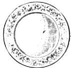
WAKEFIELD 5 pc. Place Setting $24.95

Check The Trademark For The Famous Lenox "L"