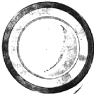
MALDON 5 pc. Place Setting $50.00

Start with just a few pieces or a complete service. You're sure to find an Oxford pattern to suit your taste whether you prefer 24-K gold or gleaming platinum.