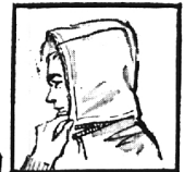
PILE-LINED ZIP-OFF HOOD