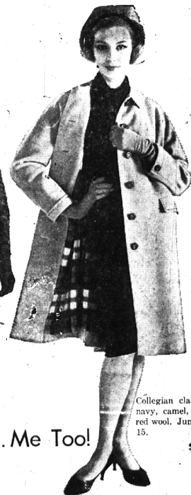
Collegian classic in navy, camel, green, red wool. Juniors 7-15. $39.98