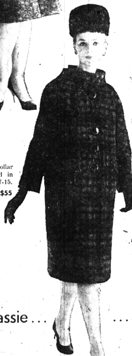
Wedding-ring collar of Italian plaid in blue, luggage. 7-15. $55