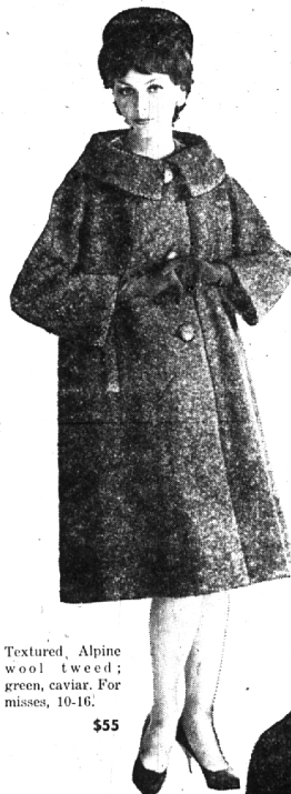
Textured, Alpine wool tweed; green, caviar. For misses, 10-16. $55