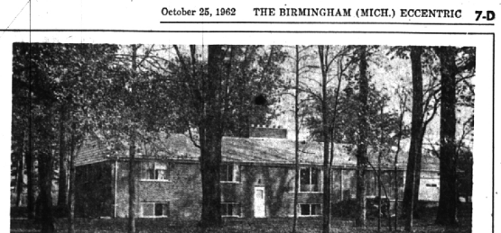
NEAR BLOOMFIELD VILLAGE—Pictured is the rear of this delightful Bi-level to give an idea of the spaciousness that makes it ideal for an active family and entertaining. There are 2 separate family rooms plus a beamed ceiling library, 3 fireplaces, 4 truly twin bedrooms and 3½ glistening tile baths. A large formal dining room, "work-planned" kitchen and attached 2 car garage complete the picture. FEW LIKE THIS! $59,750.

Roadside parks developed along Michigan's state highways have become models for other states. The first fully-equipped roadside park in the nation was built in Michigan in 1935.