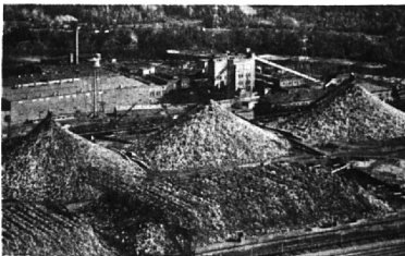
125 ft. high stock piles of pulp wood

To insure enough flood water to carry the logs on the Black Sturgeon, dams are built at various intervals to impound, in lakes, the fall rains and snows; the dams are opened successively to carry the logs to Lake Superior. The same procedures are used on most timber cutting operations wherever they are located.