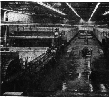
Largest paper-making machine in world

The logs then either are chipped into small pieces and put into a huge vat, where a chemical under high steam pressure "cooks" the pulp into a fine fibre; or the logs are ground into fine pulp by being pushed against large carbundum-covered cylinders. Both pulps later are merged together preparatory to being transported to the marvelous machine that changes the pulp into rolls of newsprint.