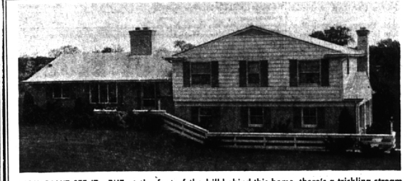
YOU CAN'T SEE IT—BUT at the foot of the hill behind this home, there's a trickling stream and pond. The impressive 4-level home, designed for a growing family, has 4 big twin bedrooms, 2 baths plus 2 lavs., formal dining room, 30 foot family room plus huge exposed recreation room, and attached 2 car garage. WOULD YOU LIKE TO SEE IT? $49,500.

The only volcano active in recent times is Lassen Peak in North California which did considerable rumbling and spouting in the years from 1914 to 1921. The area surrounding it, known as Lassen Volcanic Park, is now a part of the National Park System.