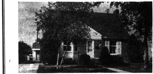
A SPIC AND SPAN THREE BEDROOM CAPE COD—Ideal for family with children—Offers every modern comfort—large screened porch with awnings—Near stores and Pierce school.