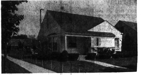
ECONOMICAL LIVING FOR THE SMALLER FAMILY—Brick and frame second floor unfinished home—2 car garage—fully cyclone fenced—large corner lot, 17,700.