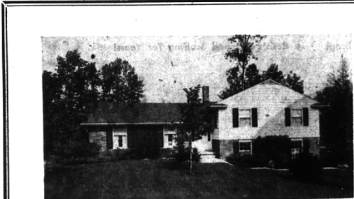
DELIGHTFUL SCENIC SETTING SURROUNDS THIS COLONIAL TRI-LEVEL—Charming early American interior—"Dutch Delft" kitchen—Like new carpets—Aprilaire humidifier—Many other extras 35,900

FRED PIERCE INC. 460 NORTH WOODWARD, BIRMINGHAM, MICH. Midwest 7-1414