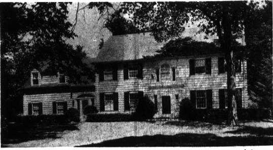
FINE SHADE TREES FORM A NATURAL SETTING FOR THIS SIX BEDROOM COLONIAL—Included are such features as a large living room and dining room—Kitchen remodeled in 1959—Screened porch—Recreation Room—Immediate possession—$5,000 down will handle.