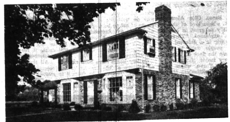
BLOOMFIELD VILLAGE—Sudden transfer causes sacrifice of this desirable three bedroom colonial—less than one year old—Artistic interior—Glass wall onto patio off family room 39,900.