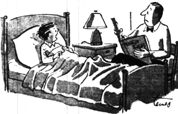
"You forgot to read the part about the copyright."

Along with the good news of this week there is the disappointing news of the first hockey defeat at the hands of Grrosse Pointe Academy of the Sacred Heart. But such a defeat only created more spirit for the Academy's next game with Grrosse Pointe University School.