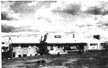
A LOVELY AND SPACIOUS HOME FOR THE SMALLER FAMILY—3 bedroom ranch with decorators interior—Pecky cypress family room—kitchen with built-ins—California fenced patio off living room. 31,900