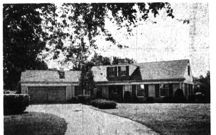
CUSTOM BUILT CAPE COD—On a ridge sloping to the river—Charming interior and exterior—3 huge bedrooms—Pine panelled library—recreation room—screened porch—a country haven on an acre plus site