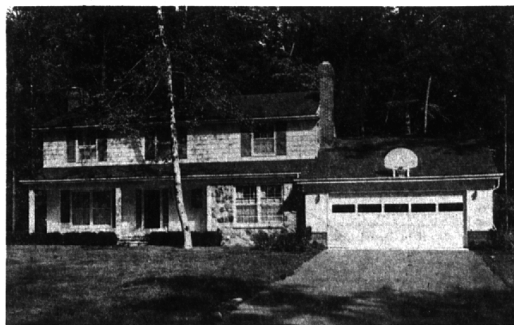
APPEALING FARM COLONIAL AMID TALL TREES ON A PAVED COURT—Near schools—4 bedrooms—Marvelous kitchen—specially designed family room—2 fireplaces—Nearly new.