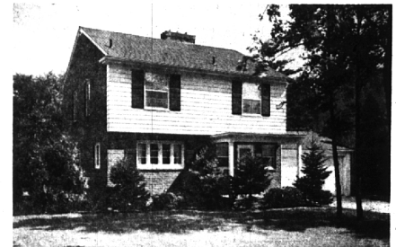
THIS DELIGHTFUL COLONIAL IS NEAR CHURCHES, SCHOOLS AND SHOPS . . . Has panelled library . . . living room with fireplace . . . recreation room has fireplace . . . screened porch . . . many fine trees and shrubs . . . Outstanding condition. Mid 20's