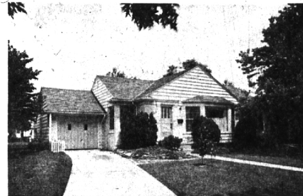
THREE NICE BEDROOMS in this very attractive brick and frame ranch—Outstanding family room—full basement with recreation room—Lovely shade trees. Low 20's