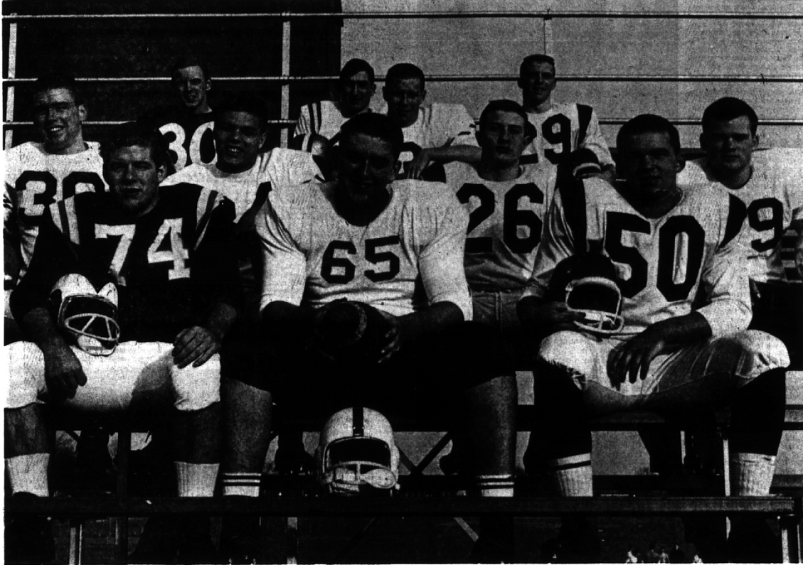
Eccentric Photo by Bill Thon