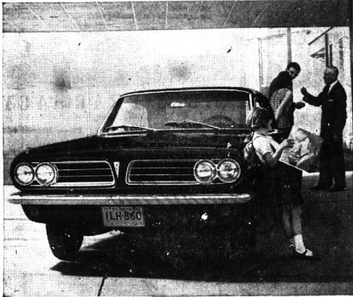
WATCH "OUR MAN HIGGINS" WEDNESDAY NIGHT, ABC-TV