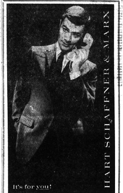
It's for you!