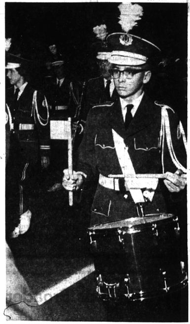
The huge parade fell into step behind the snappy Groves High School marching band. While martial music filled the air hundreds of spectators jammed the line of march down Bates, Merrill, Woodward and back into parking lot No. 5. The Seaholm marching musicians also were on hand to provide a thrilling evening for all.