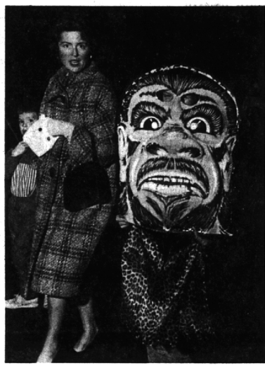
what officials described the biggest celebration "ever." Many parents went along with the kids to make sure no one was injured. If a tike was too small to make the journey alone, Dad was on hand to act as a bearer. After the parade prizes were awarded for the best costumes.