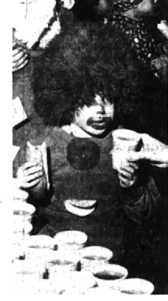
After the parade was over the youngsters were treated to hot dogs, donuts and cider provided by the Chamber of Commerce. Dozens of members of area service clubs, organizations and PTA groups manned six giant food lines.