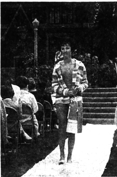
USING THE Municipal Building as a background, a pretty model shows off the latest in bathing suits at the outdoor fashion show in Shain Park Saturday morning. Sixteen local merchants took part in the show, making it the biggest display of fashion in town.

Appeals have been issued to "all citizens and organizations to start planning now for 1963 in order to assure even greater success in giving the people of Michigan and other states and nations greater knowledge about the state."