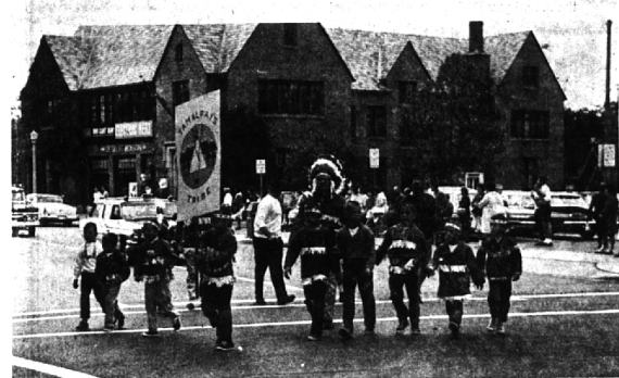
WILD INDIANS again roamed the streets of Birmingham Saturday. These Indians were not so wild, however. They were really members of a Boy Scout troop taking part in the Youth Day parade that was part of Birmingham's Michigan Week observance.