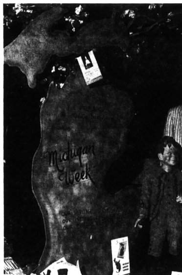
HERITAGE DAY was observed in Birmingham by the setting up of window displays by the city's merchants. This colorful and meaningful display in the window of the Prep Shop caught the eye of Ecentric photographer Al Mitchell as he covered the Michigan Week activities.