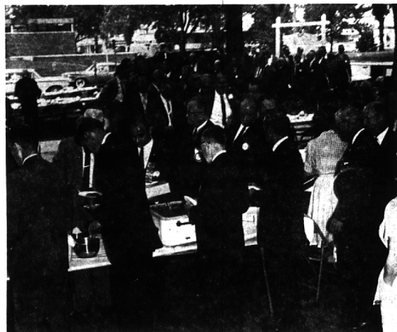
MEMBERS OF 12 Birmingham-Bloomfield service clubs are shown lining up to be served a chicken dinner on the lawn of the Community House. More than 250 attended the lunch in observance of Livelihood Day during Birmingham's Michigan Week celebration.