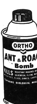
ANT & ROACH Bomb KILLS RESISTANT ROACHES AND COCKROACHES. FLYING MOTHS, CRICKETS, FLIES, CHATS, CARPENTER BEES. CONTAINS DIELDRIIN, MALATHION.

Many other Clinic Specials May 19th only!