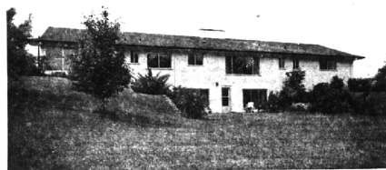
Lower Long Lake; the Colonial interior was custom designed with fireplaces in the family room, living room, and activities room. All tacked-down carpeting, built-in oven and range, jalousied porch, and lower level hobby room are other important notes in this 3 Bedroom contemporary. The landscaping was professionally planned for the site. A functional bi-level in an area of fine homes, $69,500.

Live outdoors in a haven of beauty this summer on your own spacious slate patio surrounded by the most beautiful landscaping and trees. The patio includes a barbecue and little pond. The stately interior has five bedrooms, four baths (first floor suite of two bedrooms, dressing room, and elegant bath). Fireplaces in the breakfast room and family room, which also has a bar. Beautiful all built-in kitchen. Three car attached garage. No feature has been overlooked in creating a luxurious home in one of our finest areas. $110,000.