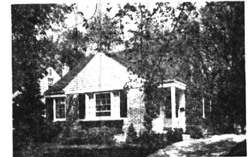
This is a perfect starter house—beautiful trees in a landscaped yard, big porch to enjoy for many months. This 3 bedroom brick and frame is in an area recognized as the most popular with young families here. Unusually good financing available, low down payment. Complete at $17,900.