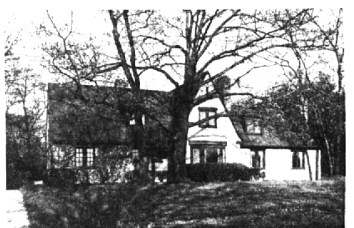
5 Bedroom English home on the former Hammond Estate. Fine remodeling—including a family room with fireplace and lovely patio on beautiful grounds. A block constructed barn is ideal for conversion to an office, guest house, or studio. In Bloomfield Hills, $31,700.

● How much time does the whole program require? Answer: Use a spreader keyed to the product and you can finish a 50x100-foot lawn in just 30 minutes.