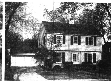
QUARTON COLONIAL — $32,500

Combines the freedom of wide open spaces with graciousness and lots of room for family living and entertaining too.