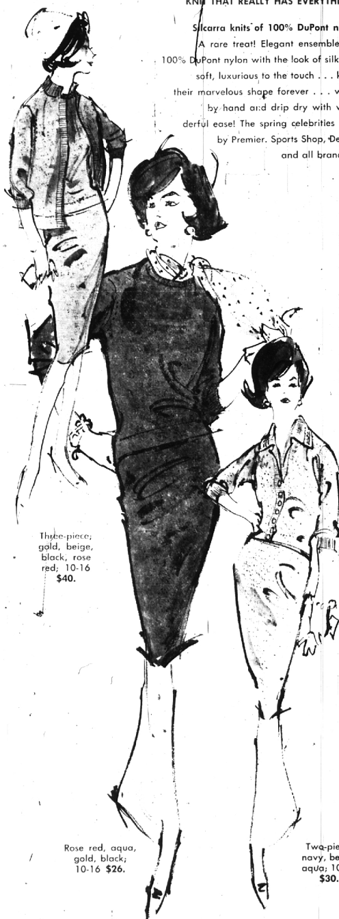
Three-piece; gold, beige, black, rose red; 10-16 $40.

Silcarra knits of 100% DuPont nylon A rare treat! Elegant ensembles of 100% DuPont nylon with the look of silk . . . soft, luxurious to the touch . . . keep their marvelous shape forever . . . wash by hand and drip dry with wonderful ease! The spring celebrities here by Premier. Sports Shop, Detroit and all branches.