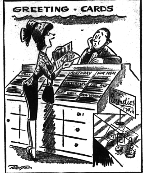
"Do you have a 'get well' card in French? It's for a friend's poodle!"