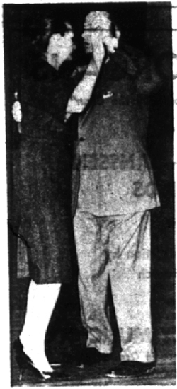
A basic dance step is demonstrated for couples during one of the lessons in ballroom dancing at the Community House auditorium. Foxtrot, Mambo, Cha Cha and the Waltz are among the steps taught.

"As a realtor I am even more aware of the benefits which accrue from its use as a central and really large meeting place for classes in the arts, senior citizens' activities and all the other community projects which are centered in the Community House. It means a great deal to newcomers to be informed that such a facility exists in Birmingham."