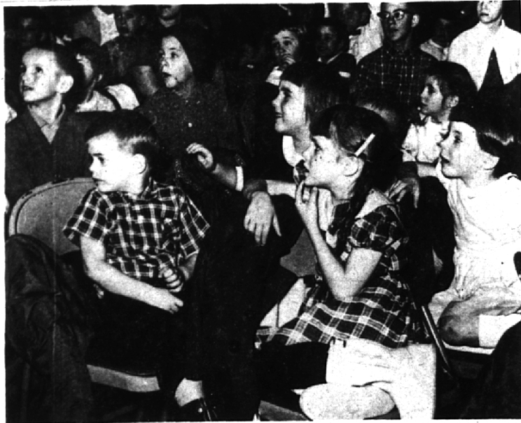
Activities for groups and individuals of all ages are available at the Community House. Some 500 children swarmed into the auditorium recently for the personal appearance of television personality If Wana Don, the star of WJBK's "Jungle Lot" show. From their expressions, it could be safely assumed that they enjoyed the show.