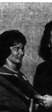
the Women's City Club, will model in a Saks fashion show 7:30 this evening.