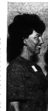
the group, will join professional models in a fashion show presented at 2 p.m. that day.