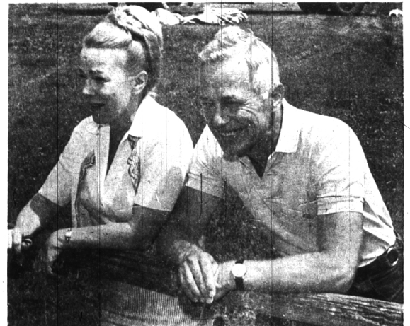
Largest outdoor Horse Show in the country takes place annually in our own backyard and this year will last through Sunday.