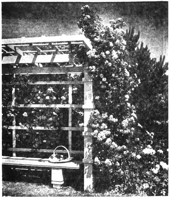
A combination bench and trellis provides a charming addition to a garden terrace. A climbing arched and trellis provides a charming addition to a garden terrace...