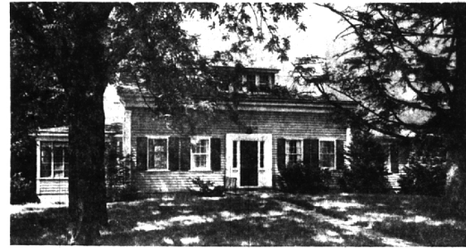
A Dream of Early America in Bloomfield