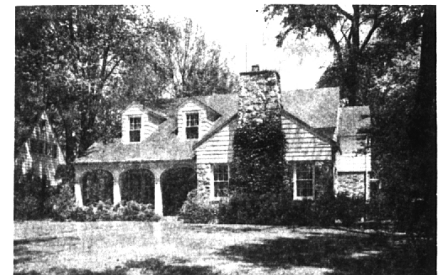
Near Quarton Schools in Bloomfield Village. Attractive Cape Cod with Carpeting—3 Bedrooms, 2 1/2 baths. Library—sloped and beamed ceiling in living room. Nearly new furnace. Attic fan. 33,900.