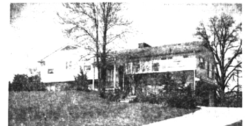
5 BEDROOM TRI-LEVEL. Plenty of room for happy living in picturesque countryside overlooking Kirk in the Hills. Owner transferred. Spacious living room. Oak paneled dining room. 2 baths, 2 lavs. Built-in range. 2 air conditioners. Block topped drive. Just 44,500.