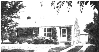
California Bound . . . 3 Bedrooms, excellent condition. Car and a half garage, carpets and drapes. 30 yr. FHA available. Only 16,900.

239 S. Woodward, Birmingham MI 4-7000 32740 Franklin, Franklin MA 6-9600