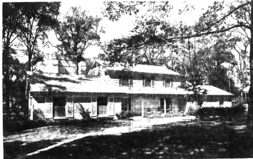
THE HOUSE YOU DREAMED ABOUT. In the Hills of Bloomfield Village. 3 superb bedrooms. Delightful family room on patio. Nearly new, carpets and drapes . . . 1 bedroom on lower level. Outstanding design! Good Location.