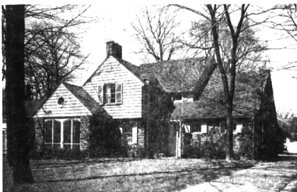
5 Bedroom Colonial on Westwood Drive. Lovely large living room and dining room with carpeting. 2 baths, 2 lavs. Basement has tiled floor. Near Quarton School. 38,500.