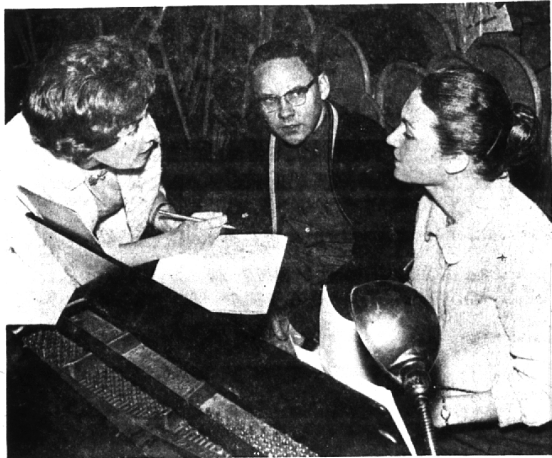
The Birmingham Eccentric dropped in last week on one of the strenuous four-day-a-week rehearsals of "The Bloomingham Newcomers", musical comedy opening tonight as part of the fifth annual Arts Festival.