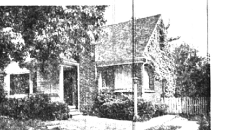
The Buy of the Area—Priced below FHA value at only $16,900. 3 Bedrooms, with 17 foot porch. Fireplace in living room. Extra lav. Recreation room. Incinerator. Beautifully finished second floor. Some carpets—outstanding value!

Don't buy plants that look wilted, even if you are told that