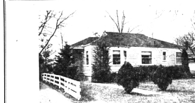
Near Quanton School. $17,900. Charming ranch painted yellow, wonderful for growing children on a tree-shaded lane, free from traffic. Carefully maintained! Full basement—floor completely tiled. Large screened porch. 3 Bedrooms, some Carpeting. Recreation room. Walk to the Chesterfield shops and Churches.

ONE QUART equals five half-cup servings; two quarts equals a pint of preserves or three pints.