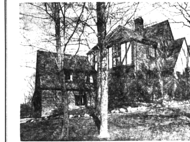
A 4 Bedroom 3 1/2 bath English Brick in the Country. Screened porch for summer enjoyment—plus a patio. Two car attached garage—plus a tool shed and carport. Beautiful landscaping. Horses allowed with ample grounds for riding. Bloomfield Hills Schools. $34,250.