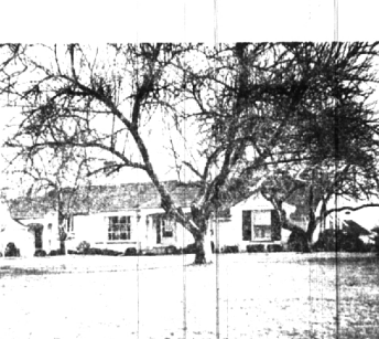
The spaciousness of this two-level house is matched by its charming exterior. 3 delightful bedrooms and 2 baths comprise the west end of main floor. 4th bedroom and bath on lower level. Large activities room with bar. A wonderful buy at $49,750, on Lone Pine Road.