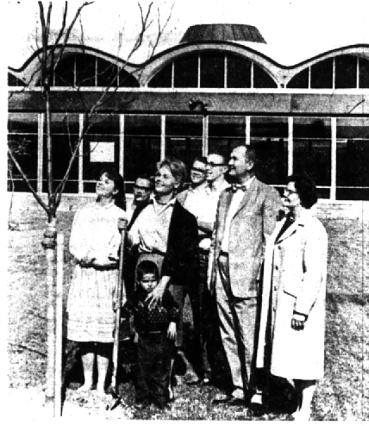
A tree grows at Groves