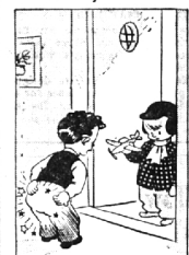
"I can't go out and sail airplanes today—I've been grounded!"

Multiple exposure . . . now you can run a Classified Ad 3 times for only $2.70 (non-business, up to 15 words, cash rate). Dial Midwest 1-1100 now.