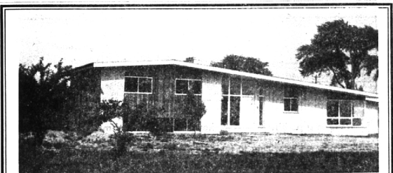
Nestled on a high site overlooking sparkling Meadow Lake, you'll find this Contemporary Tri-level both dramatic and functional. Master bedroom with dressing suite, main level family room plus huge lower level recreation room, 2 1/2 baths, and art. 2 car garage. READY FOR YOU! $37,500.

MAX BROOCK INC. 300 S. Woodward, Birmingham MI 4-6700