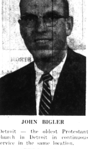
JOHN BIGLER - the oldest Protestant church in Detroit in continuous service in the same location.