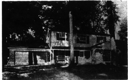
AMONGST TOWERING HARDWOODS

Excellent condition, and price — $44,500.