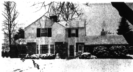
BLOOMFIELD VILLAGE FARM COLONIAL

For the 3 bedroom family, everything you want: Handsome living room with a large front bay and a fireplace. Paneled recreation room with a fireplace and bar. Fireplace in the library. Two full baths, first floor and basement lavs. Tiled basement. Additional storage over the garage, conveniently reached. A screened porch overlooks lovely landscaping and a fountain.