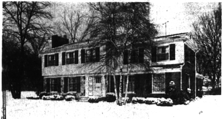
4 BEDROOMS, 2 BATHS, 2 LAVS

New 4 bedroom, 2½ bathrooms, family room, 2 fireplaces, separate dining room, decorator's interior. $39,500. In Birmingham, and near new schools. $39,500.