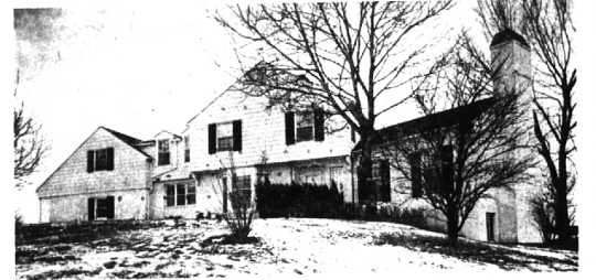
Tremendous View of Fine Surrounding Properties —Keep Horses, If You Like

Large living room with fireplace Separate, 16 ft. dining room Lovely breakfast room 4 cherry bedrooms, 3 1/2 baths Library, sewing room Recreation room with fireplace A charming family home—Complete with carpeting and draperies throughout—Fire and burglar alarm system—Sunken garden and beautiful landscaping—Two separate heating units make for very moderate heat costs and family comfort.