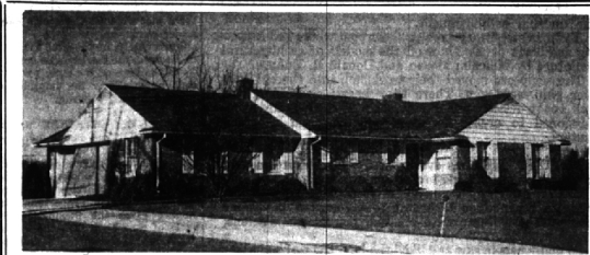
YOU'LL BE SURPRISED at the spaciousness of this long and low brick ranch in the Adams Road area. There are FOUR nice bedrooms, a relaxing library for "Dad", hearty-warmed living room, 1 1/2 baths, and an 2 car garage. Pleasant country atmosphere with all city improvements. CALL AND SEE $23,800.