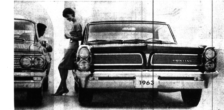
WATCH "OUR MAN BIGGINS," WEDNESDAY NIGHT, ABC-TV

Your Society correspondents, featured throughout this section, want news about you.