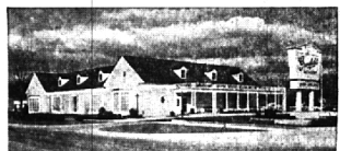
725 South Hunter Boulevard, Birmingham