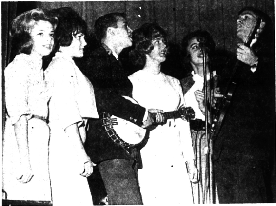
HOOTENANNY: According to a national magazine, a hootenanny is to folk singing what a jam session is to jazz, and Birmingham-Bloomfield youngsters buy that! Or at least they did last week at the opening party of The Assembly. Spontaneously during intermission, a group of the young ladies joined