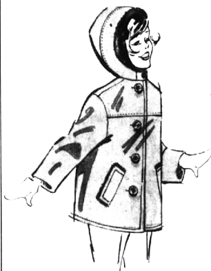
GIRLS' PILE-LINED CAR COATS 8.99

For school-bound girls, a special pile-lined car coat with a hood to keep her snugly warm... water repellent and wind resistant. In basic colors, sizes 7-14.