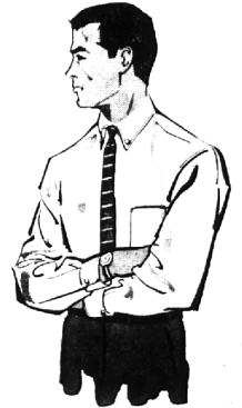
SPECIAL! MEN'S WASH 'N' WEAR DRESS SHIRTS 2.79

Long sleeve dress shirts in oxford button-down style with button cuffs. Blue or white. 14-17, 32-35. Not shown: white broadcloth with modified spread collar, permanent stays and convertible cuff, white. (No mail or phone orders)