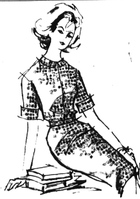
SMART TRANS-SEASON SEPARATES...SAVINGS PRICED 4.99

Easy-care cotton dresses designed by a famous maker! Slim fully-lined skirt with matching bermuda collar blouse. Green, blue, copper, 10-18. (No mail or phone orders).