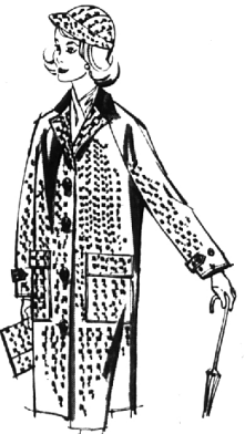
REG. 10.98 RAINY- DAY COAT SPECIAL! 6.99

Chase the rainy day blues away with a cheerful print or gay solid color raincoat. See our large selection of styles in easy-care nylon, many with hats, S-M-L.