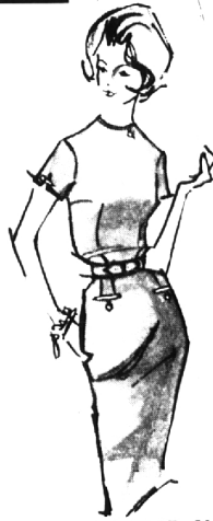
REG. 14.98 JUNIOR AND "JUNIOR PETITE" DRESSES 9.00

The young looks, the new looks... for career or afternoon wear, and all at an exciting "Anniversary Sale" price. Shown is just one style from this famous-name collection. Sizes 5 to 15. (No phone or mail orders)