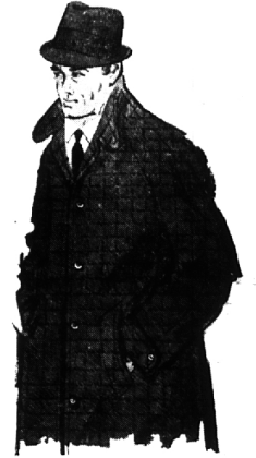
REG. $55 FALL ALL-WOOL TOPCOATS 44.88

Distinctive styling in Fall wool topcoats. Choose "Tankard Twist" with notch lapel, split shoulder and slash pockets, or "Tripper Saxony", all wool flap-pocket style. Reg., Short, Long.