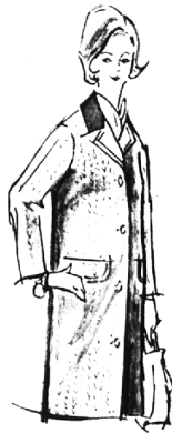
CLASSIC CHESTERFIELD PRICED TO PLEASE $27

Demery's covers the Fashion Front for 1962 with style plus value! Featuring the most important Junior silhouette... the 100% wool tweed classic Chesterfield coat in grey or brown, sizes 7-15.