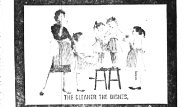
THE CLEANER THE DISHES,