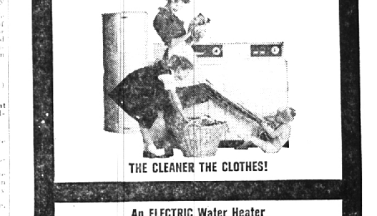
THE CLEANER THE CLOTHES!