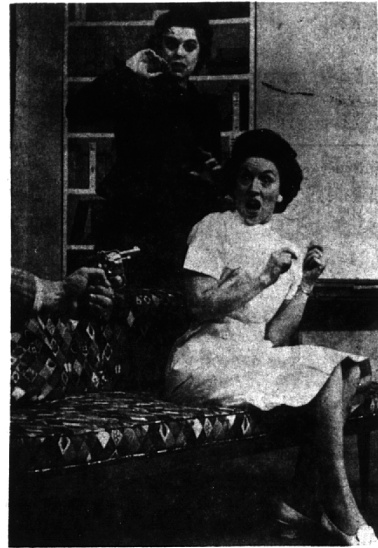
'House on the Cliff'

Saturday, April 28 PI BETA PHI ALUMNAE —Observing of the sorority's 95th birthday with luncheon at Red Run Golf Club, North Woodward Alums will be hostesses. CHRIST CHILD SOCIETY —Annual spring dinner dance, Birmingham County Club. Tuesday, May 1 MICHIGAN DIVISION, WFGA —"America the Beautiful", exhibition of table settings and flower arrangements, Wright-Kay, 1600 Woodward, Detroit, 5:30 p.m. Private preview. Wednesday, May 2 VILLAGE WOMAN'S TEA —"Troubadour Tea" at Meadowbrook Hall, 1 to 4 p.m., for building fund. BIRMINGHAM EASTERN STAR —Meeting, Masonic Temple, 7:45 p.m. Thursday, May 3 BIRMINGHAM BUSINESS WOMEN'S CLUB —Dinner followed by business meeting and musical variety show, 6:30 p.m. Friday, May 4 BOPOFRs —Sock hop at Birmingham Country Club, 9 p.m. to 12 m.