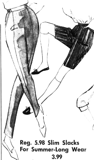
Reg. 5.98 Slim Slacks For Summer-Long Wear 3.99

For the long, lean look . . . choose these tailored, dacron* polyester cotton easy-care slacks. In teal, loden, charcoal, 10-18.