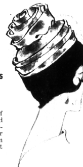
New Summer Millinery 5.00

An exciting collection of showroom samples, special purchase hats, many one-of-a-kind. You'll find the most intriguing shapes and colors . . . fashion's latest whims . . . elegant trims, all specially priced.