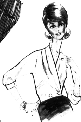
Reg. 6.50-7.98 Summer Blouses 3.99

Blouses to match the mood of summer . . . smart dressmakers, impeccably tailored shirts, dainty and fresh jewel neck styles. These are the blouses that costume your skirts . . . perfect for college, career and cupers. Sizes 30-38.