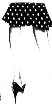
Reg. 99c Pr. "Demery" Nylons 89c Pr.

The wonderful flattery of Demery seamless mesh and plain nylons . . . perfectly proportioned in short, medium, or long lengths. Choose from lovely summer tones to accent your new wardrobe.