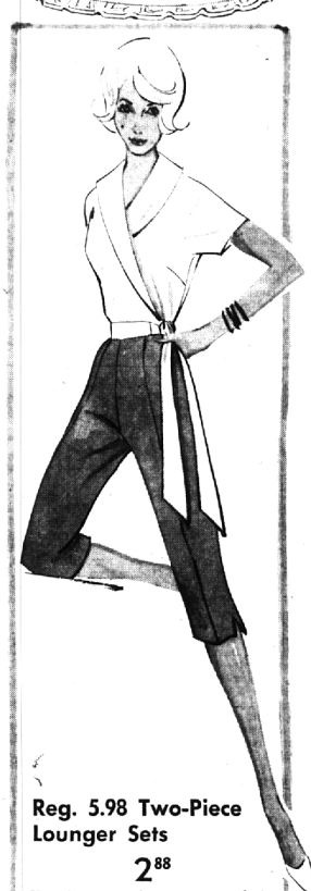
Reg. 5.98 Two-Piece Lounge Sets 2 88

Kept to casual summer comfort . . . you'll revel in the ease of this around-the-house fashion favorite. A smart pedal pusher with side tie overblouse in wonderful cool cotton, in blue, pink and beige. Sizes 10-18. Now is the time to buy for yourself—for gifts.