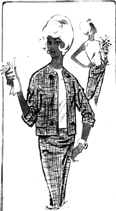
Three-Piece Tweed-Look Featherlight Suit 17 90

Go weightlessly in cool, soft tweedy acetate-and-rayon . . . and keep going April to September! A poised, clean-cut little suit that makes for wonderful wardrobe versatility . . . and pampers the fashion-dollar. Unlined jacket has white buttonholes to match linen-look rayon blouse, skirt is seat-lined. Black or brown with white. Sizes 10-18. (Other styles in the group.)