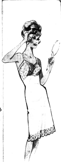
Special Nylon Tricot Panelled Slip 3 99

A delicately designed whisp-of-a-slip with lined fine lace top in soft easy-care nylon tricot. Panelled all-around for a longer fashion life, perfect for sheers . . . destined to be the perfect underscoring for summer fashions. White only. Sizes 32-40.