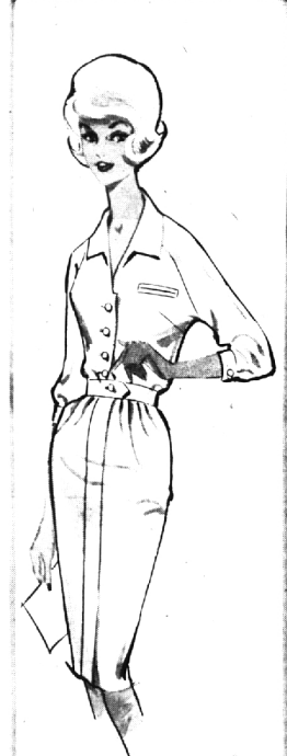
Reg. 8.98-10.98 White Cotton Uniforms 5 90

For women in white! Discover for yourself how easy it is to look pretty on duty in these smart uniforms . . . all at exciting savings. In crisp, cool cotton, regular and junior sizes.