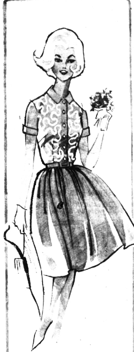
Reg. 12.98-14.98 Summer Dresses 7 90

Gay summer dresses, full of charm and originality . . . in cool cotton, dacron* polyester or fresh seersucker. Choose from a bevy of solid or print stylings. (Shown is a cool cotton available in pink or blue, 5-15.)