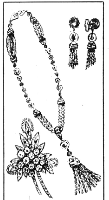
Reg. 2.00-12.00 Sample Sale of Jewelry 1/2 OFF

An exceptional opportunity to find the most superb summer jewelry at most amazing savings! All famous maker designed . . . choose from multi-strands, novelties, chains, in necklaces, earrings, etc. The perfect accent to any smart summer outfit.