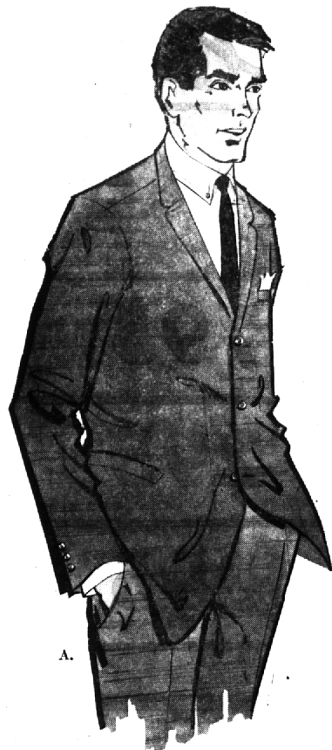
A. Reg. 55.00 Classic Single-Breasted Suits For Men 38 88

Here's the look newest on the suit scene, leading the way for spring and summer '62. Single breasted 3-button elegance in dacron* polyester and wool worsted blends, in rich new patterns in proven good taste. Regulars, shorts and longs.